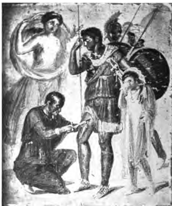
Fig. 97. Æneas Wounded.

rest was disturbed by the vision of his dead cousin Hector appearing before him, all bloody from the wounds he had received at Achilles' hands, and